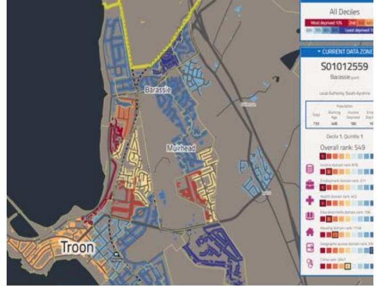
Figure 1 - 2020 SIMD Data Barassie

Figure 1 details the 2020 SIMD rankings for Barassie S01012559 datazone. Since 2016 the Barassie shorefront area is reported to be Decile 1 (549) which places it in one of