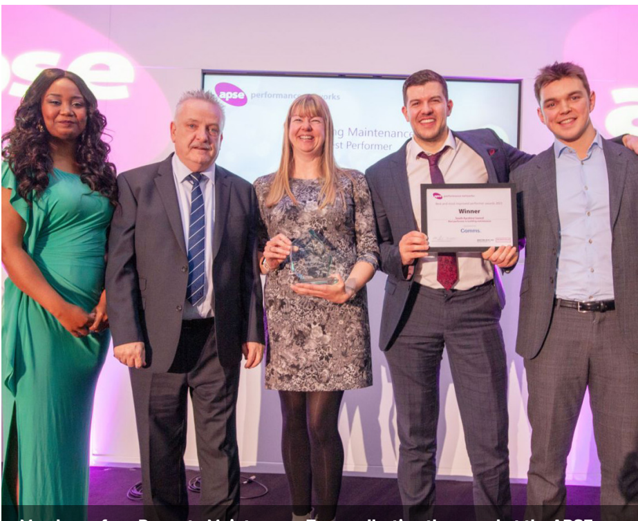
Members of our Property Maintenance Team collecting the award at the APSE Awards Ceremony.

The awards are open to all local authorities across the UK and winning is a testament to the continuous hard work and dedication of everyone in the service. We'd like to say a huge congratulations to the team for this well-deserved achievement.