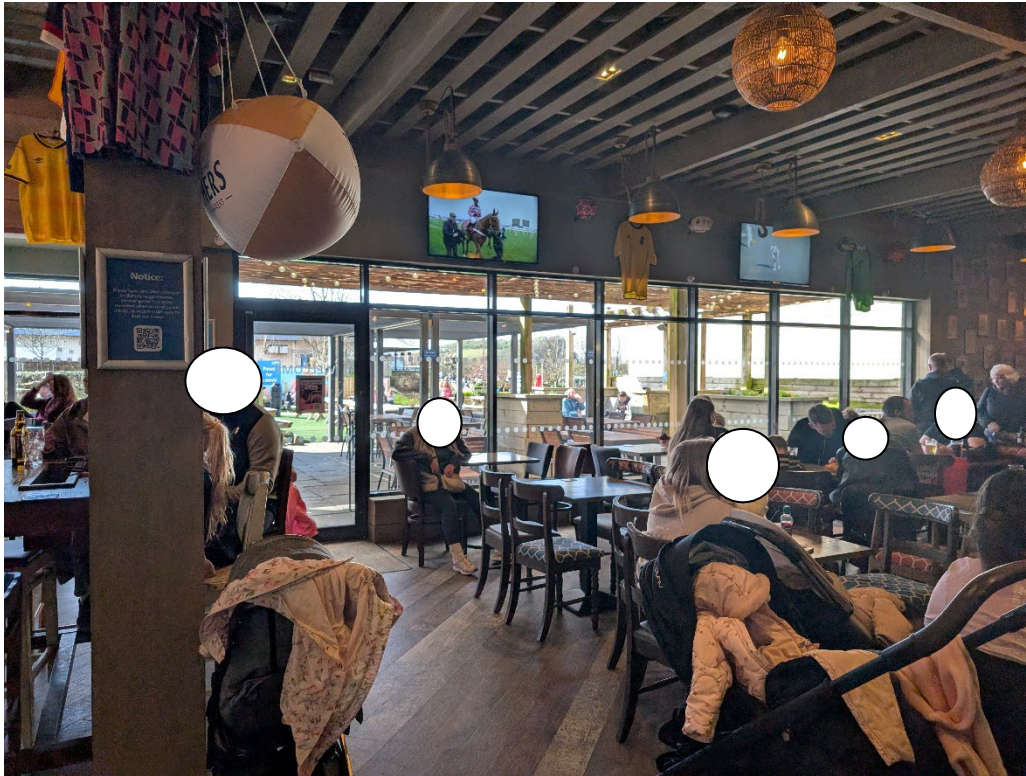
Photographs show the premises in general use on a weekday by families