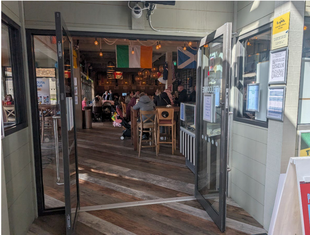
The entrance to the Lighthouse Bay area and the licensed premises show the secure entry doors (which will be stewarded) and show the CCTV in place