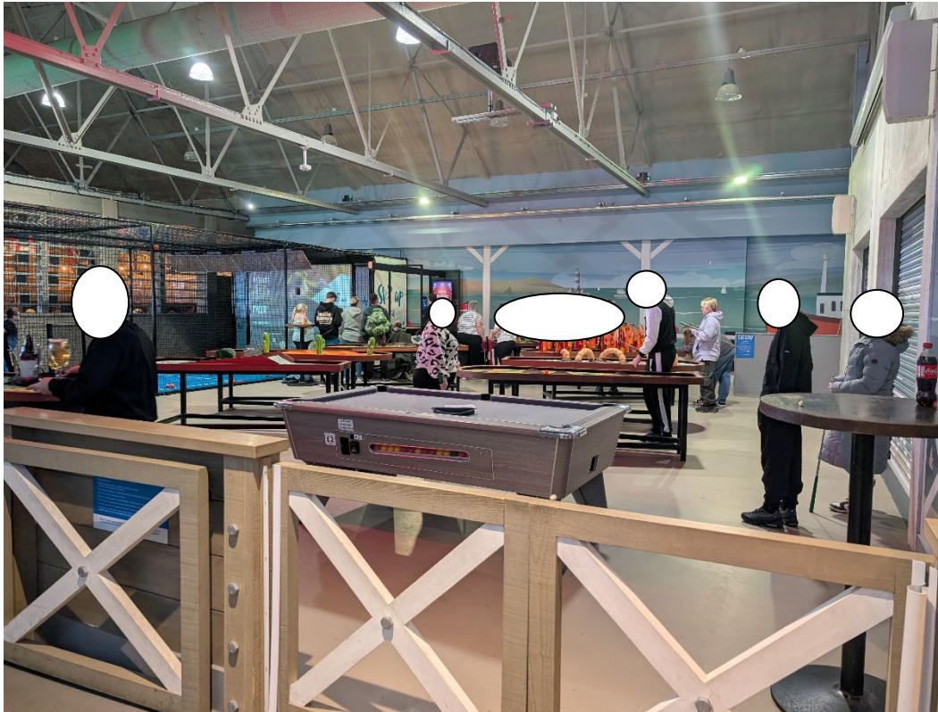
Photographs show the additional areas dedicated to family entertainment within the venue