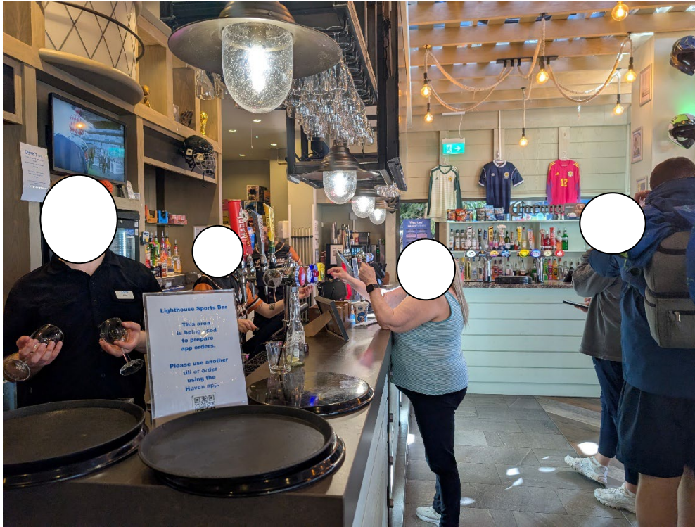
Photographs show the Lighthouse Bar in operation on a general week day