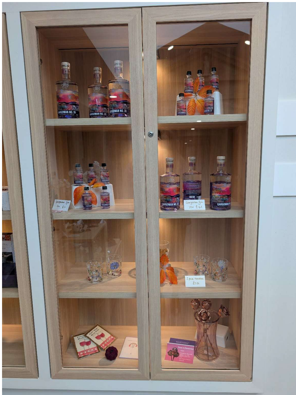
Photograph 1 – Showing the two shelves dedicated to alcohol display