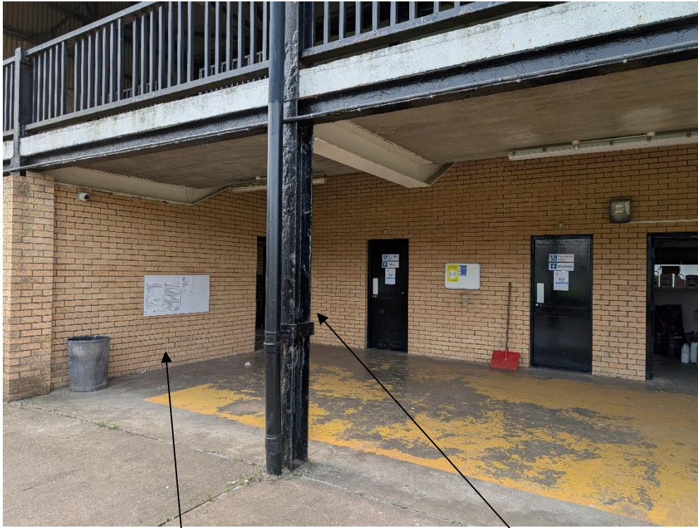
Proposed location of mobile bar/servery