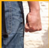
Abusive, threatening, intimidating or violent behaviour