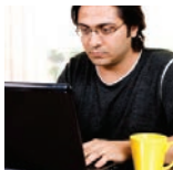
Any other format that meets your needs (eg, audio tape – online or by email)

The complaint will be passed to our antisocial behaviour officers who will review the complaint and contact you to discuss the options available to you.