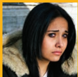
Racial and other forms of harassment