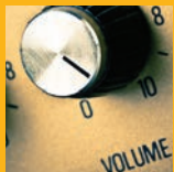
Loud music and noise nuisance