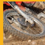
Off road biking