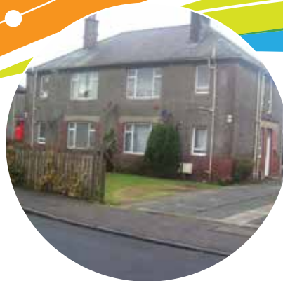
South Ayrshire Council Traditional four in a block