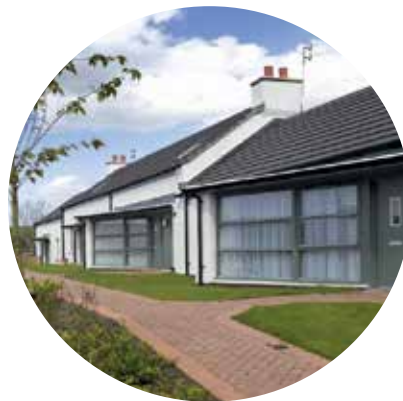
Ayrshire Housing Kirkmichael