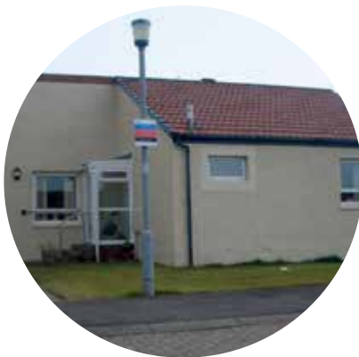
South Ayrshire Council Sheltered type property