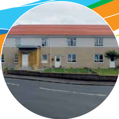
South Ayrshire Council Flatted type property