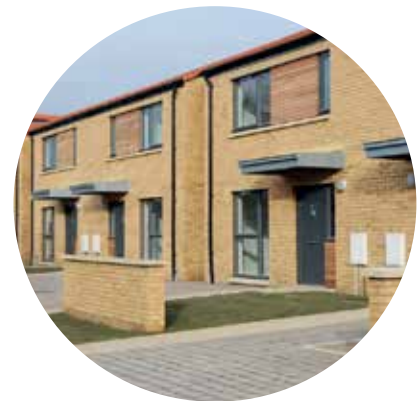
Ayrshire Housing Lochside, Ayr