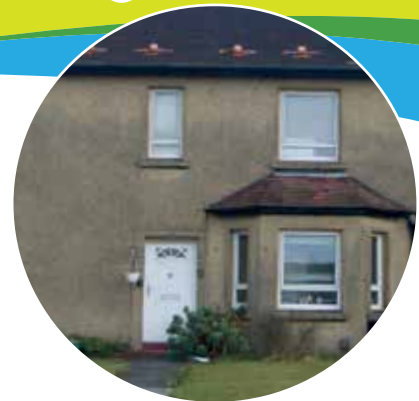
South Ayrshire Council Semi detached type property