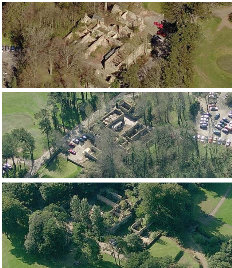
Aerial site images