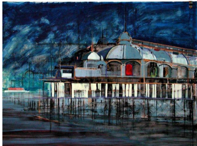
Offshore Shadows by Liz Knox

Many of the paintings on show in the exhibition are for sale.